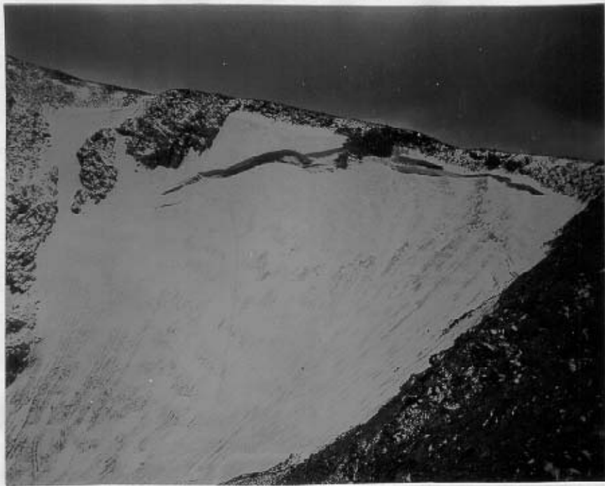
Tyndall Glacier from Station "c"