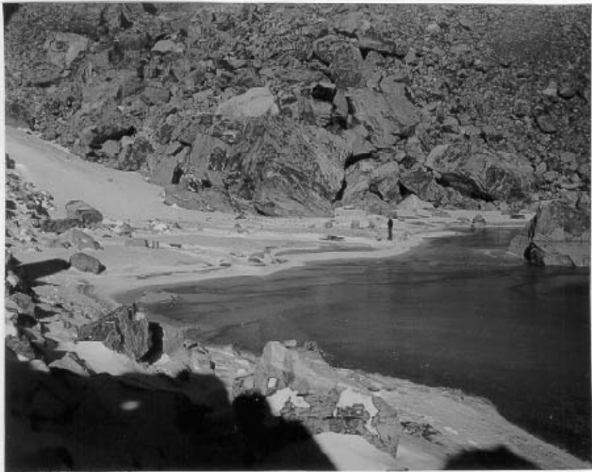
Andrews Glacier and Andrews Tarn