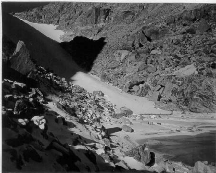
Snout of Andrews Glacier Red line represents glacier terminus