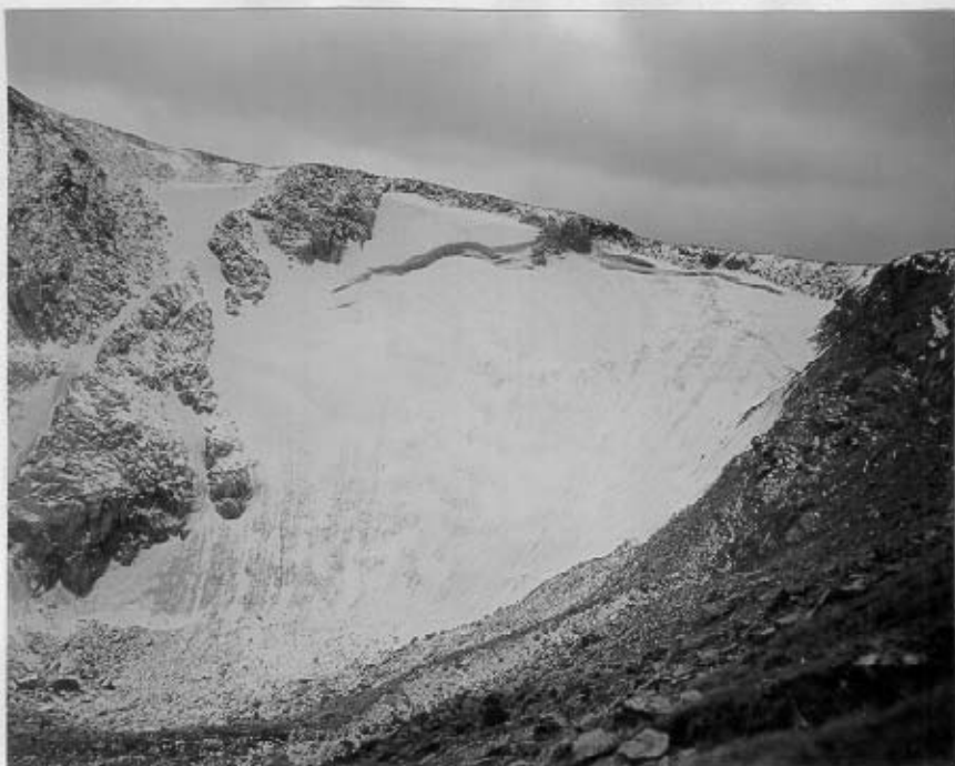
Tyndall Glacier from vicinity of Station "b"