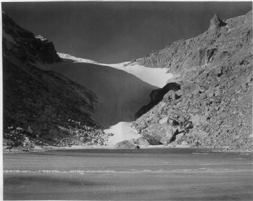
Andrews Tarn and Glacier from Point "C"