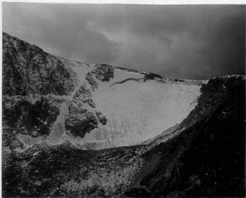
Tyndall Glacier from Station "a", near hitching rack on Flattop Mountain