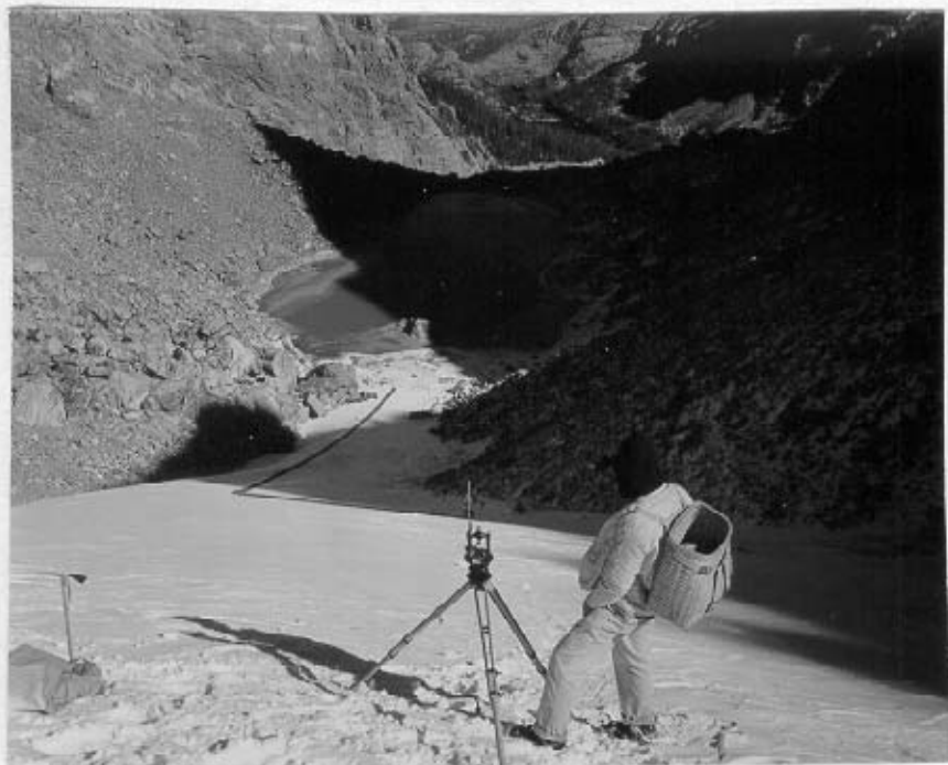
Longitudinal Traverse on Andrews Glacier Red line represents offset of survey at lower end of glacier. (See survey statistics)