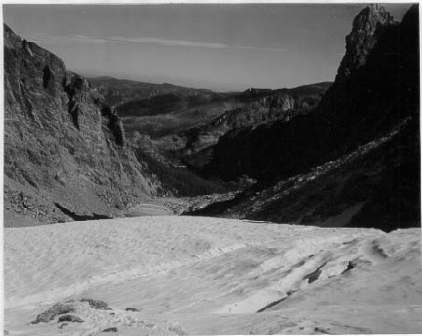
Andrews Glacier from Point "D"