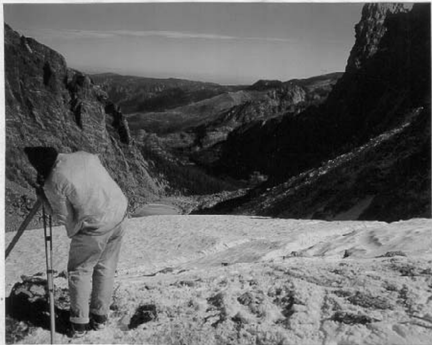
Andrews Glacier and Point "D"